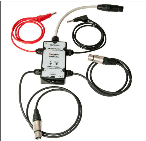
SDRM Cable for TM1700/TM1800/EGIL200