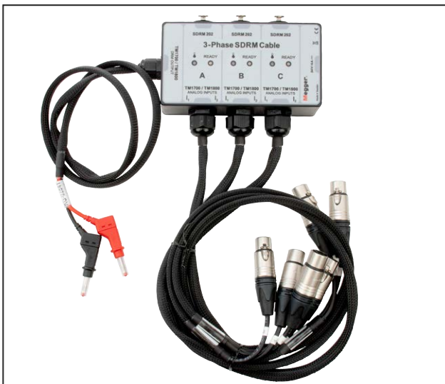
3-phase SDRM Cable for TM1700/TM1800/EGIL200