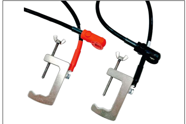
Red current cable 3.0 m (9.8 ft) Black current cable 0.5 m (1.6 ft)