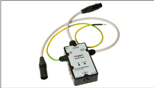
SDRM Cable for EGIL