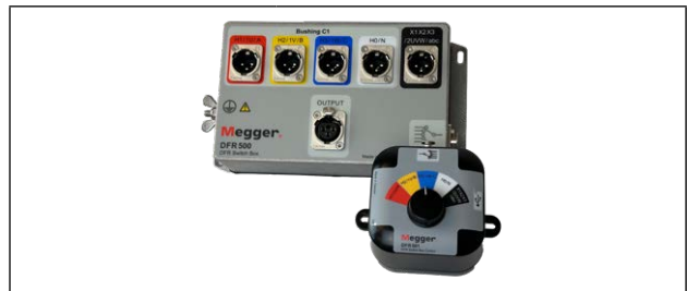
DFR500 Switchbox, AG-98090