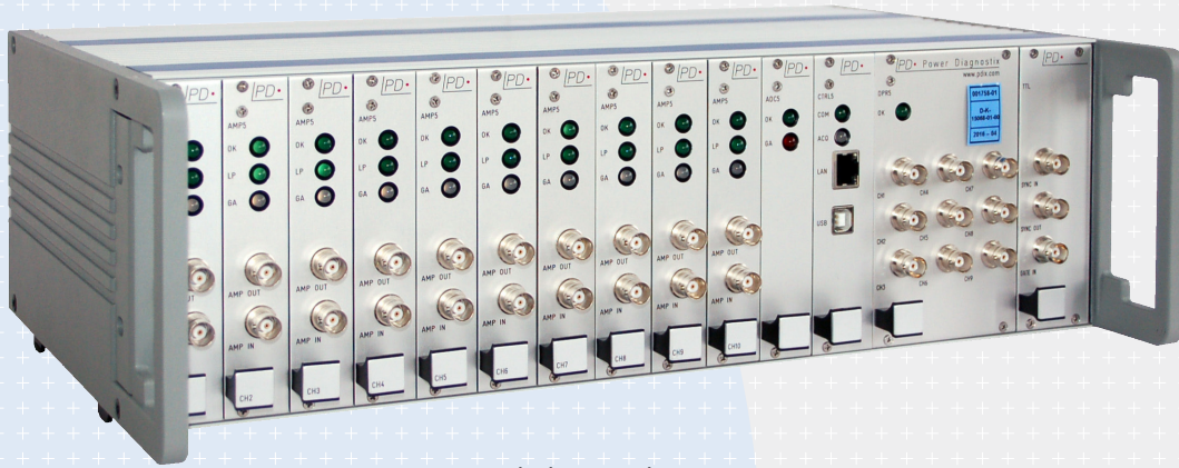
ICMsystem desktop version

For three-phase power transformer factory acceptance testing, a multi-channel ICMsystem is preferably used due to enhanced tools for in-depth analysis. With its true parallel PD acquisition of up to ten channels, the overall testing period is substantially shortened by features such as the automatic calibration cross-coupling matrix. ICMsystem offers both - narrow and wide band PD pattern acquisition, according to IEC 60270. The instrument comes with an embedded spectrum analyser for advanced PD analysis in frequency domain. Moreover, it is an excellent tool to use in case of noisy test environments. Additionally, acoustic sensors can be interfaced with ICMsystem for PD fault localisation.