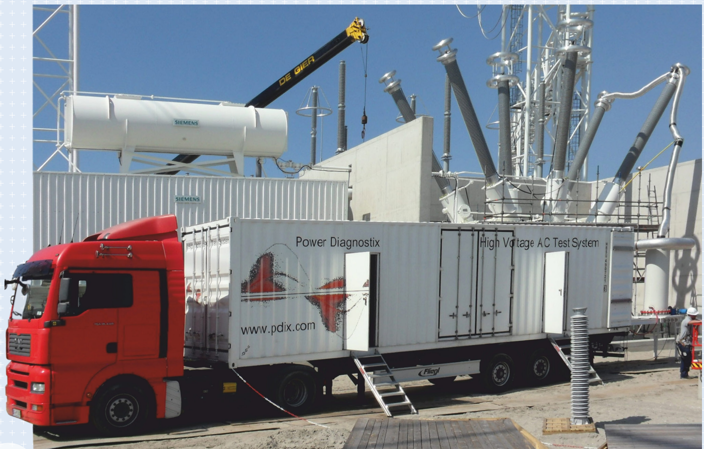
Power Diagnostix mobile test system

Power Diagnostix isn't just a manufacturer of partial discharge testing instruments. Engineers are also involved with the development, design, configuration, and integration of the full system. Additionally, Power Diagnostix provides customer training and commissioning. After the system is installed and in service, the job does not stop there.