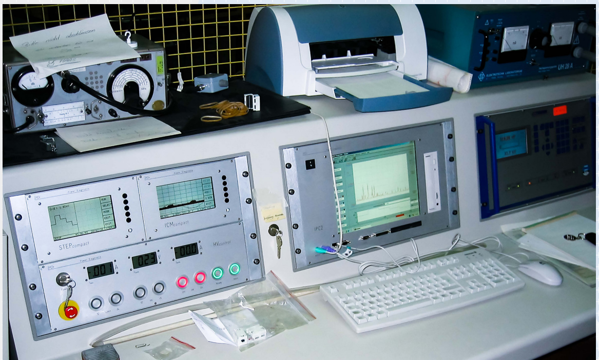
ICMcompact embedded in a control desk with additional control hardware