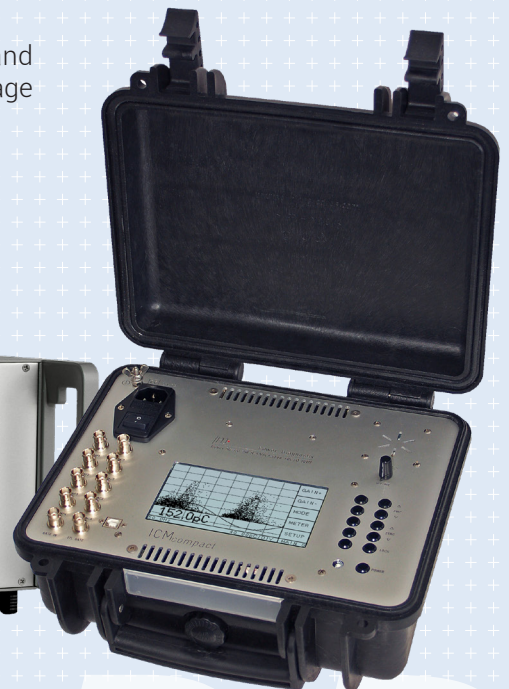
The ICMcompact shown in two of three available housing versions

A typical configuration for power transformer factory acceptance testing of partial discharge includes: